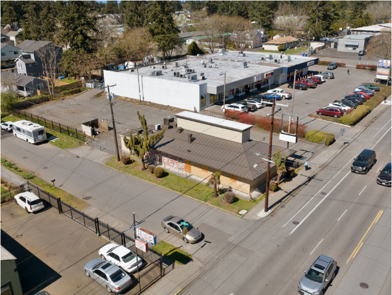
SE Portland - 2,160 sqft building. User/Investment opportunity to acquire a freestanding former Pizza Hut on a 16,500 square foot lot. Sale includes land and building. Restaurant building with dining room, hoods, walk-in refrigerators, walk-in freezer, and restroom. Many options including an owner-occupied business, investment with a tenant, and/or development. High visibility corner lot on SE 122nd Ave with high traffic.