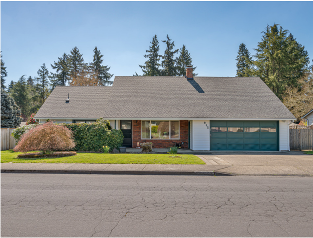
Beaverton - 5 BD, 3 BA. 2,250 sqft. Formal living room featuring a beautiful brick fireplace, dining room, kitchen with eat-in bar opens to family room. Two large bedrooms upstairs with full bath. This home sits on an expansive 10,000 square foot lot, featuring a fully fenced, park-like backyard.