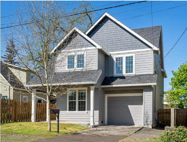
SE Portland - 4 BD, 3 BA. 2,115 sqft. Built in 2017. One bedroom on the main level. The bright, open floor plan includes a vaulted ceiling, gas fireplace and a sliding door to the covered patio. Kitchen with SS appliances, quartz countertops, tile backsplash and pantry. Wood floors on the main level.