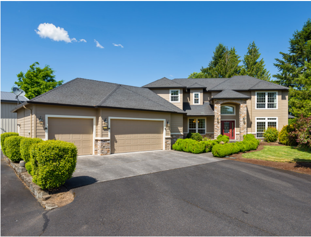
Battle Ground - 3 BD, 2.1 BA, 3,327 sqft. This beautiful home is located on a picturesque 2.26 acres and features three bedrooms and two and half baths with the primary suite on the main level. The gourmet kitchen features stainless steel appliances and a convenient island. The property also includes covered RV parking and a 2,000 sqft shop.