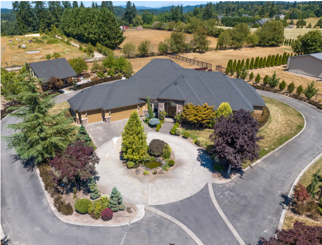
Battle Ground - 5 BD, 3.1 BA, 4,656 sqft. Extraordinary one level home on a 2.75 acre estate with guest house. This grand home features quality craftsmanship, soaring ceilings, and an expanse of large windows. Outside, a circular driveway and extensive iron fencing surrounds the property.